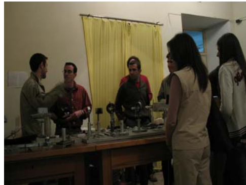
Institute for Physical Researches