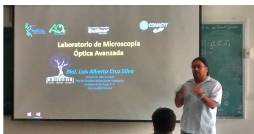
Seminario de la Facultad de Física Agosto-Enero de 2016

During this year the student chapter looked not to active. It is of my knowledge that members of this chapter did not ask for any financial resources. However some member students helped to organize and assist to some speech in our faculty, and also developed outreach activities. Some student members tried to promote the chapter by expositions in “La Feria de la Luz” (Fair of Light – Applied Optics Laboratory at Physics Faculty in Universidad Veracruzana).