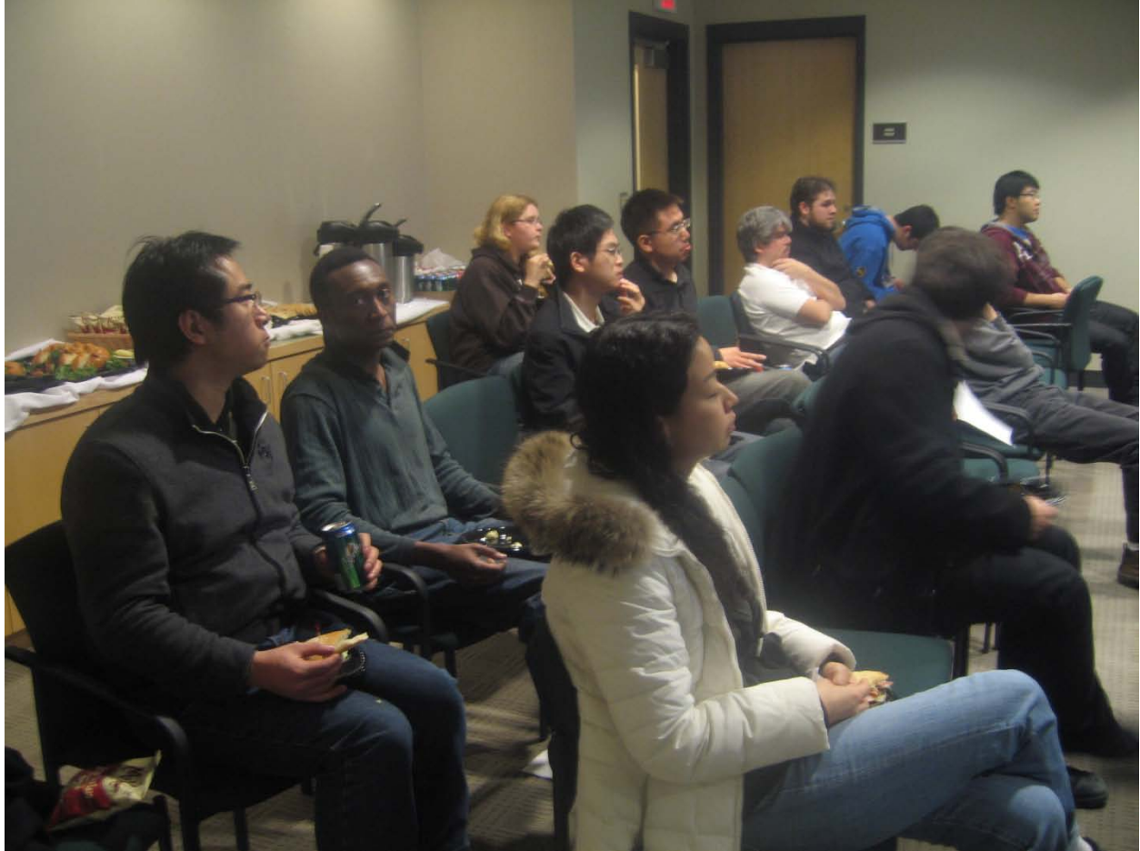
In the photo: UConn SPIE members

We revised Chapter Constitution and Bylaws based on the template provided by SPIE to meet the University requirement.