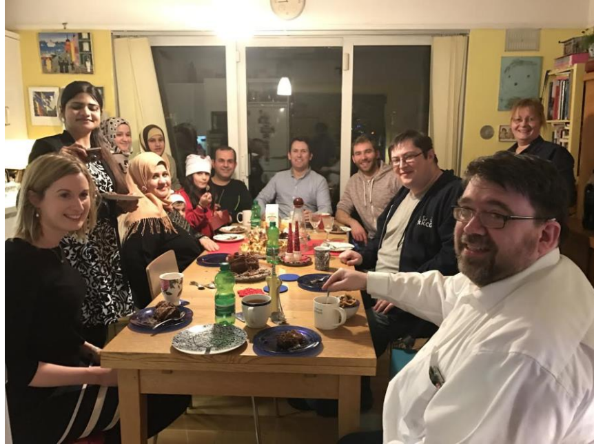
Picture 3: Picture taken chapter annual meeting and Christmas celebration, December 2016.

Furthermore, since the beginning of DIT SPIE student chapter, we are very closely organizing some events and sharing our research works. Recently, we have been invited to attend an invited talk in DIT and our chapter members have actively participated.