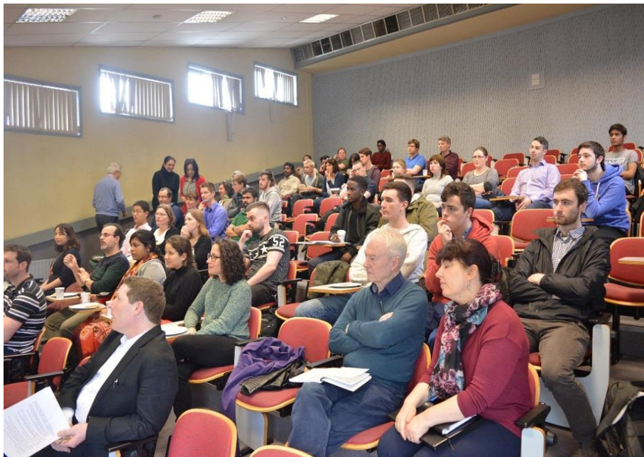
Picture 4: Picture taken at DIT invited lecture talks, February 2017.

Furthermore, since the beginning of DIT SPIE student chapter, we are very closely organizing some events and sharing our research works. Recently, we have been invited to attend an invited talk in DIT and our chapter members have actively participated.