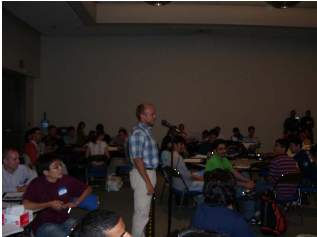
Introduction during Student Leadership Workshop 11.08.06