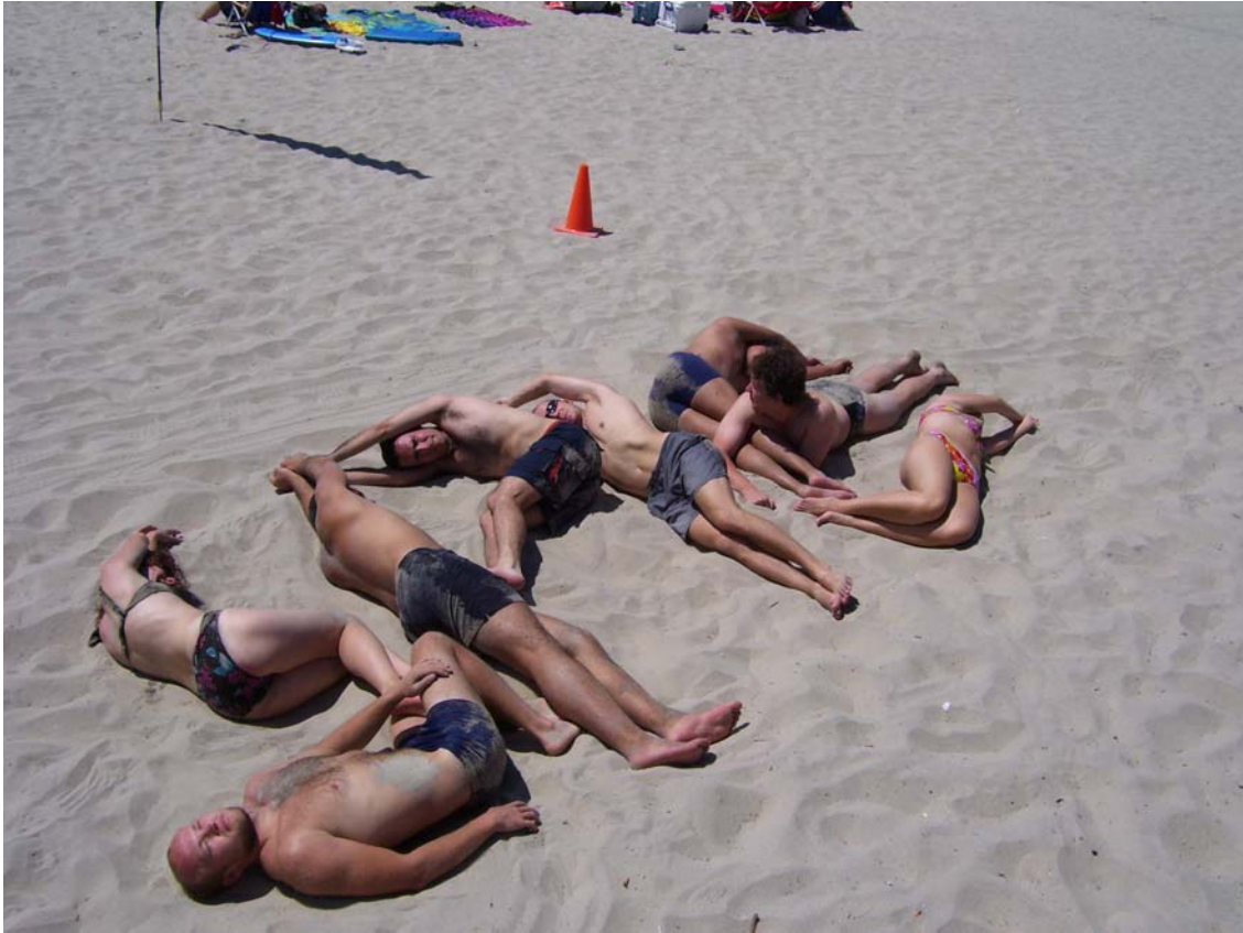
The SPIE body sign made at Mission Beach in San Diego