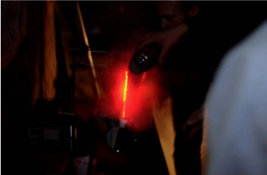
Visualization of beams in Fabry-Perot interferometer