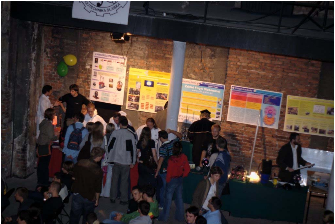
Experiments demonstrations for school students