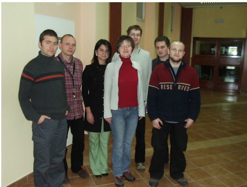
Silesian University of Technology SPIE Student Chapter