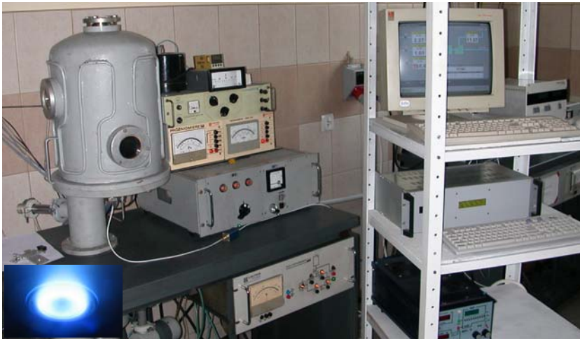
Magnetron deposition measuring stand