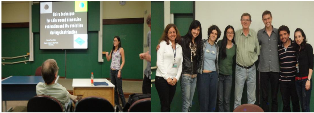
Some pictures of our workshop on July 4