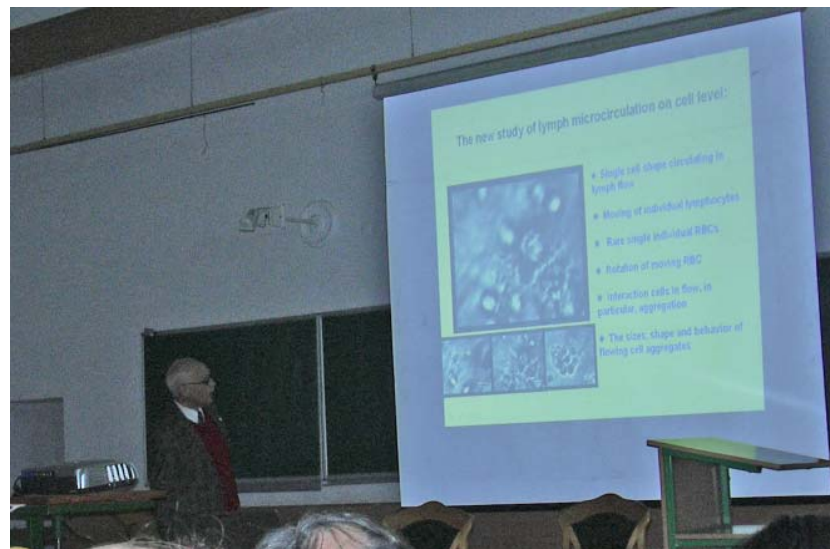
Dring the Lecture