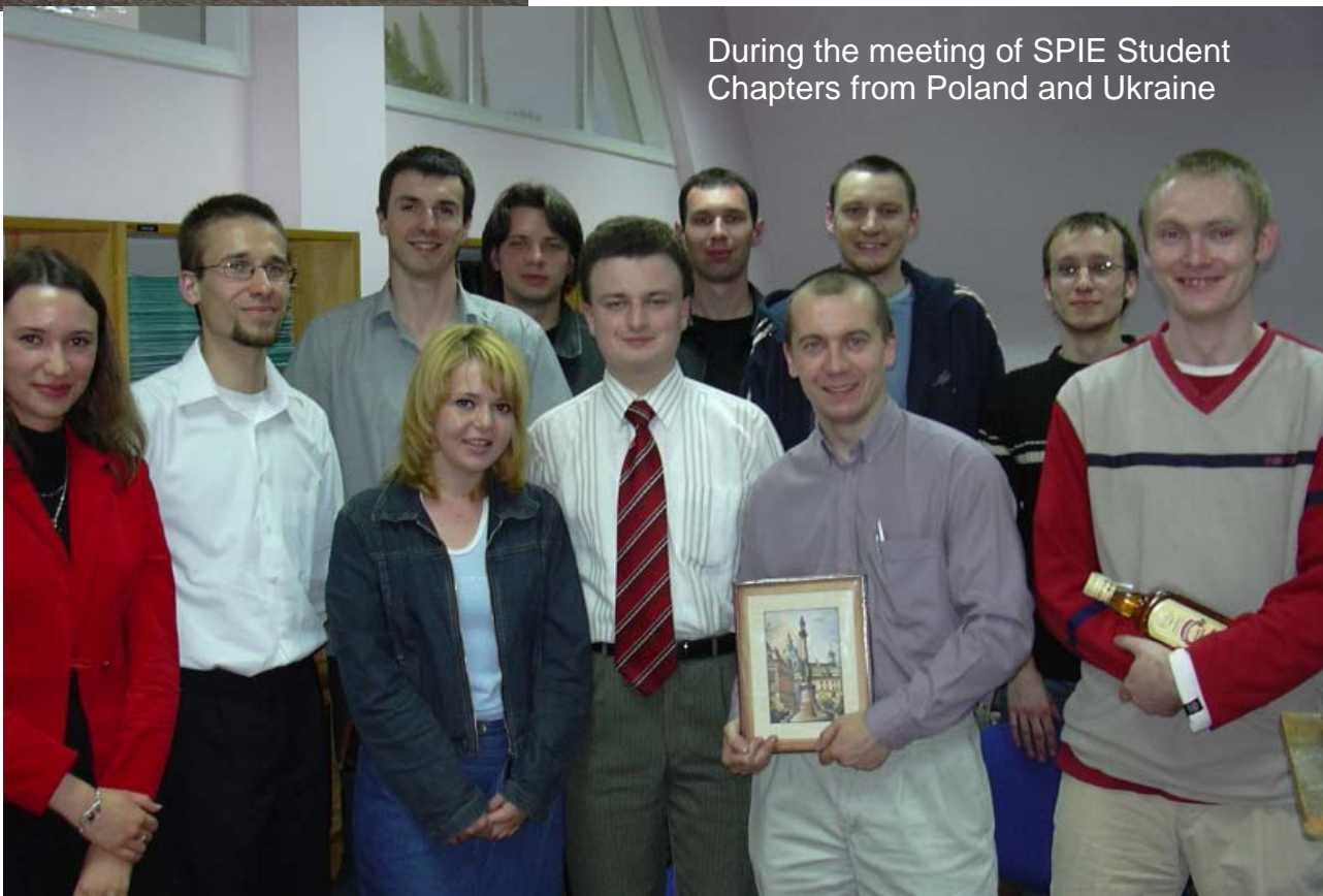
During the meeting of SPIE Student Chapters from Poland and Ukraine