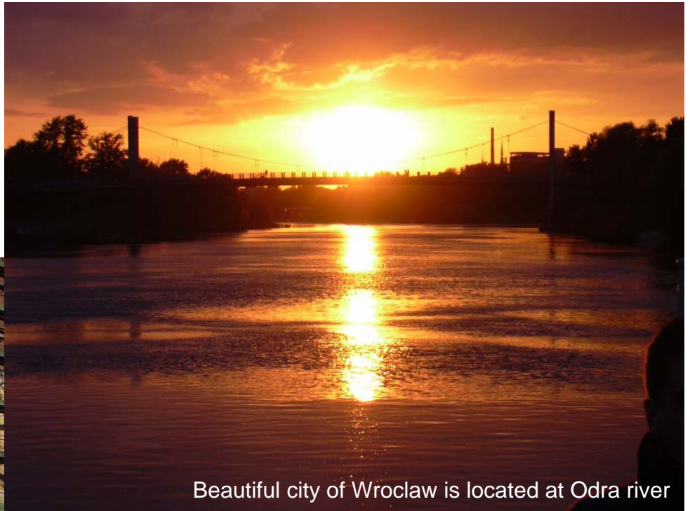
Beautiful city of Wroclaw is located at Odra river