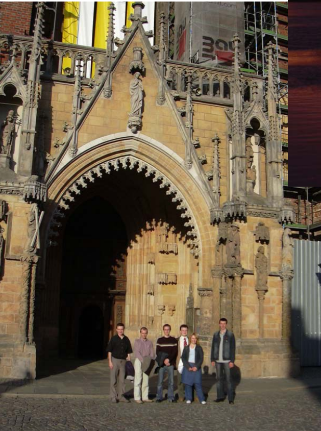
At the ancient part of the city