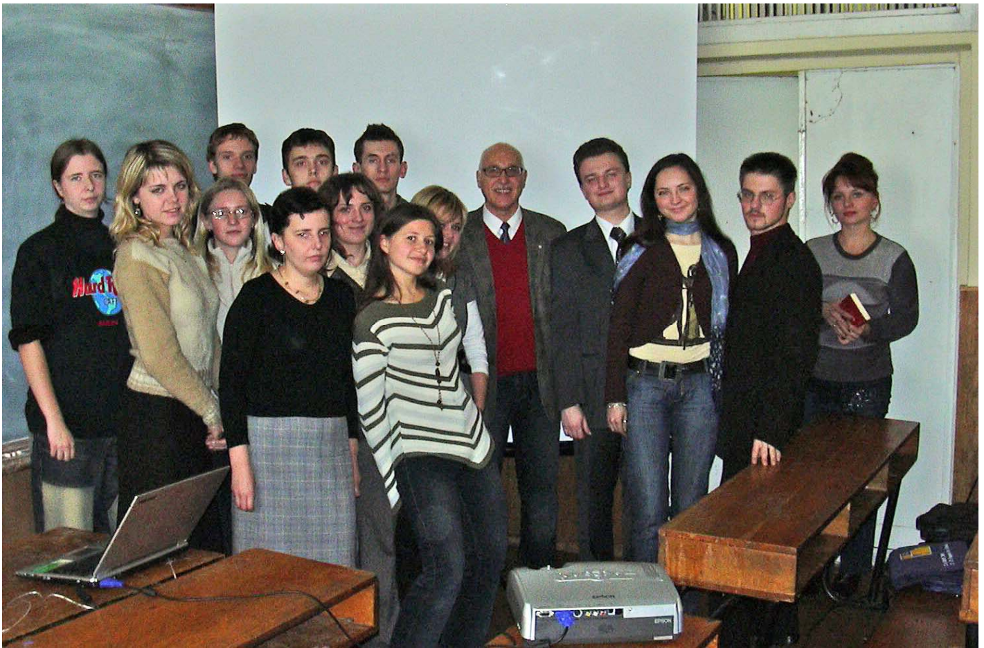
Chapter members during the Course