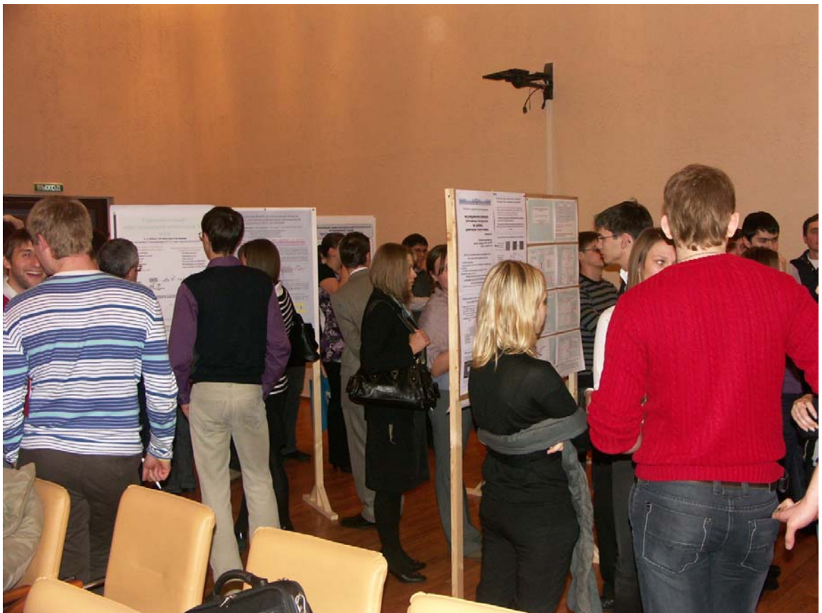
Poster session on the conference “Photonics and Optical Technology” - 2011.