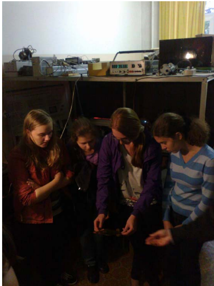
Schoolgirls with hologram in Hologram Laboratory in our Institute.