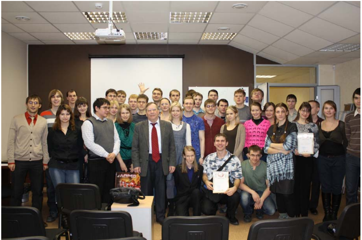
Participants of the conference “Photonics and Optical Technology” - 2011.