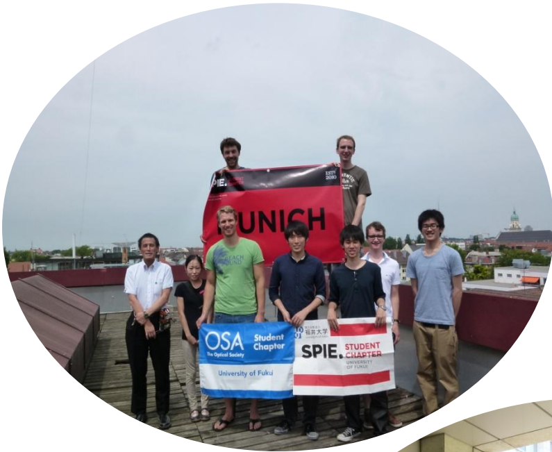
Visiting Technical University of Munich