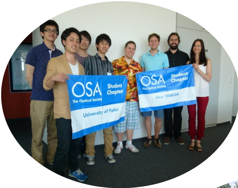
Visiting h bar OMEGA

We communicated about student chapter and the research. We got valuable experiences in their lab tours. We also introduced our student chapter activities and our research. At the same time, we exchanged views on the researches of each other. We built a good relationship with each student chapters.