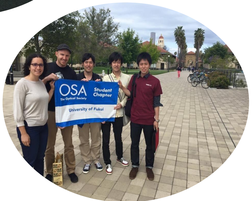
Visiting Stanford University