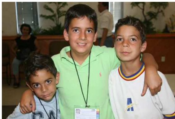
Figure 3.5: Science Club for Children.