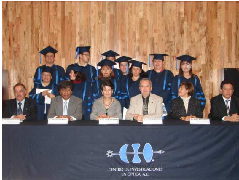
Figure 3.9: Graduation.