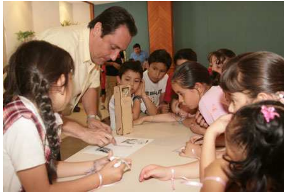
Figure 3.4: Science Club for Children.