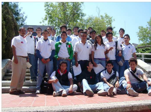
Figure 3.1: Second Hands on Workshop for High School Students.