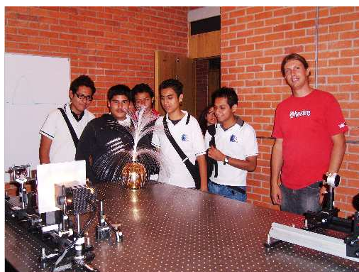
Figure 3.2: High school students in one of the labs.