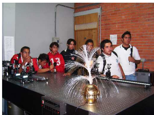
Figure 3.3: Hands on Workshop for High School Students.