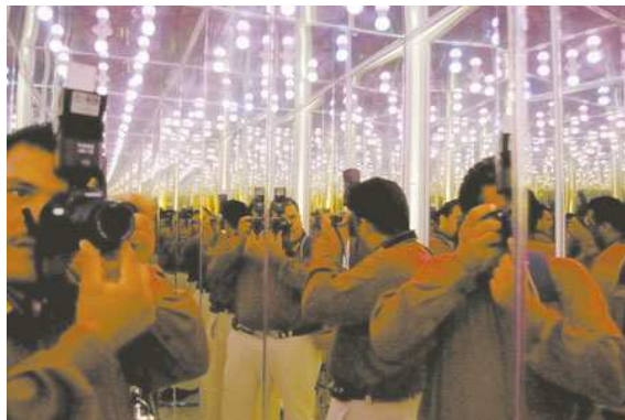
Figure 3.6: Optical Science Museum exhibition.

This autumn CIO opens the doors of the Optical Science Museum, this museum has three halls with 40 expositions showing optical effects, 3D shape reconstruction and laser applications. The Optical Science Museum is a project managed by the Committee for Science Divulgation at CIO. The Chapter members contribute as guides with experiment explanations